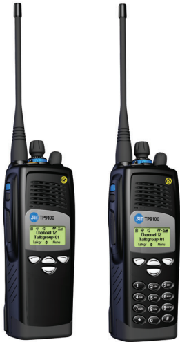
Models shown IS TP9155 and IS TP9160