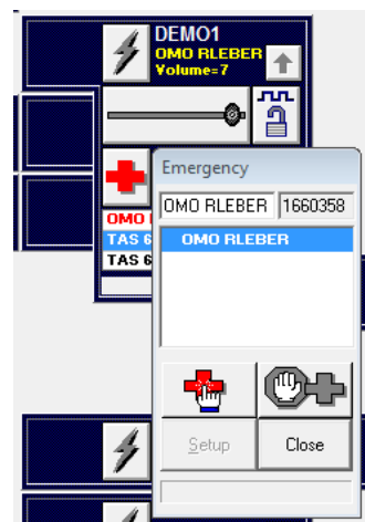
Figure 3 - Emergency List

The dispatcher handling the call should click on the emergency alarm icon, which will display the Emergency List (see figure 3). The Emergency List displays all pending Emergency Alarms; check for multiple alarms.