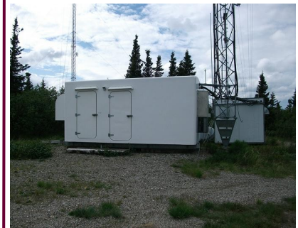
Garner Site June 8, 2012

Website: http://www.alaskalandmobileradio.org